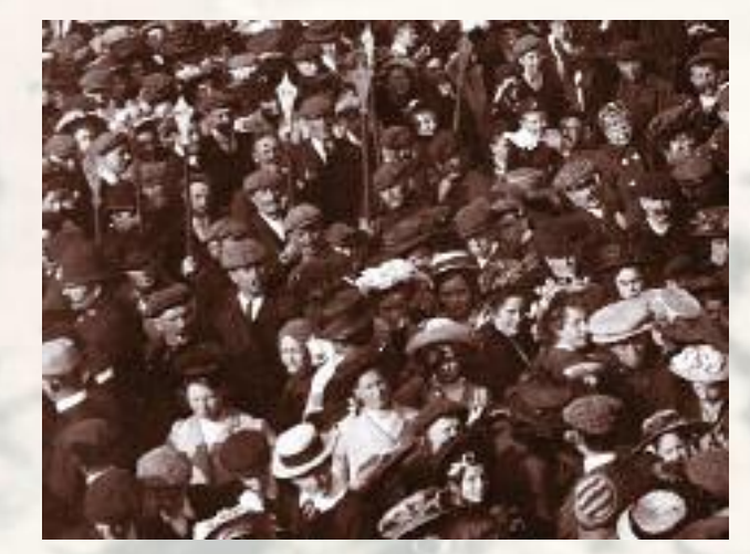
Sixth Charter reading at the site of the Chequers in 1909.

Third Charter reading at the Greyhound Inn with traditional horseplay.