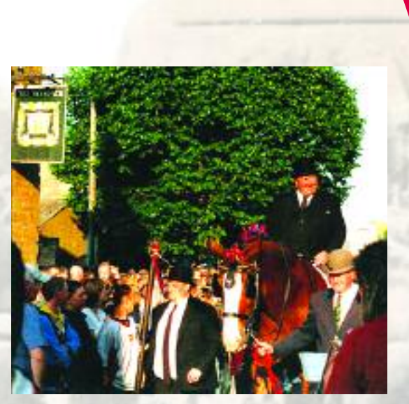
The seventh Charter reading at the Woolpack

he Proclamation Ceremony begins at the stroke of six o'clock in the morning outside the west door of the Church on the Monday after the Feast of the Holy Trinity (known locally as Rowell Fair Monday). After this reading, the Bailiff rides on horseback accompanied by a bodyguard of halberdiers and the Rowell Fair Society Band and the Charter is read at all the public houses, or sites of those now closed, in the town. After each reading a hearty cheer is given for "God save the