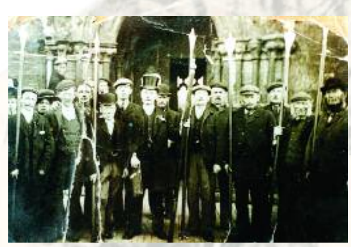
First Charter reading at 6.00am at Parish Church, West door