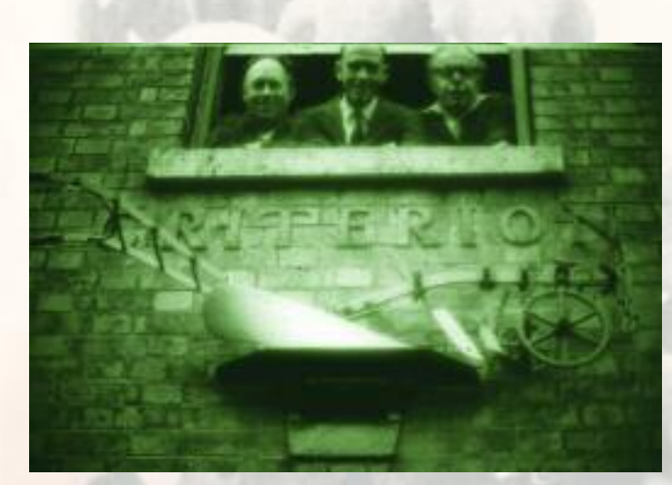
Second Charter reading at site of New Inn and Balls Foundry